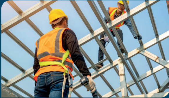
Infrastructure and Steel works

Our maintenance team is fully equipped with the necessary tools for helping our commercial or residential customers. We use the best techniques and methods to deliver the best maintenance services the market has to offer.