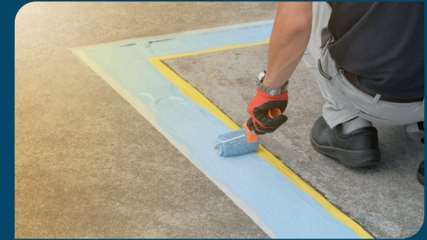
Car Parking works including Curb Stone and Asphalt work