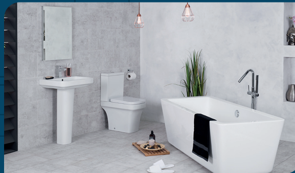
Plumbing and Washroom Refurbishment