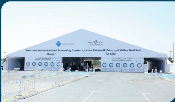
Health Sector and Hospitals Construction