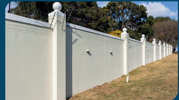
Boundary Walls Construction