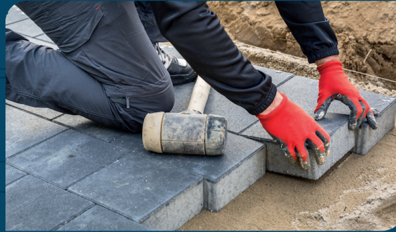
Painting, Flooring, walls, Ceiling, Grouting, Interlock Installing