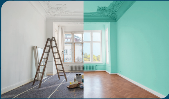
Refurbishment, renovation and interior design with lighting