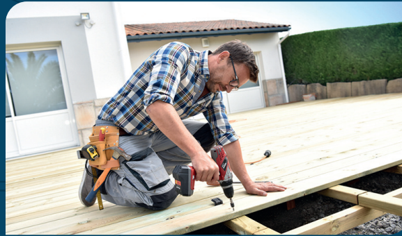
All types of Wooden Works