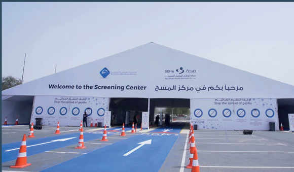
Health Sector and Hospitals Construction