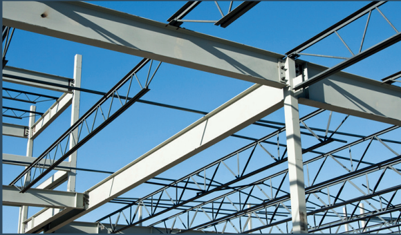
Infrastructure and Steel works

Our maintenance team is fully equipped with the necessary tools for helping our commercial or residential customers. We use the best techniques and methods to deliver the best maintenance services the market has to offer.