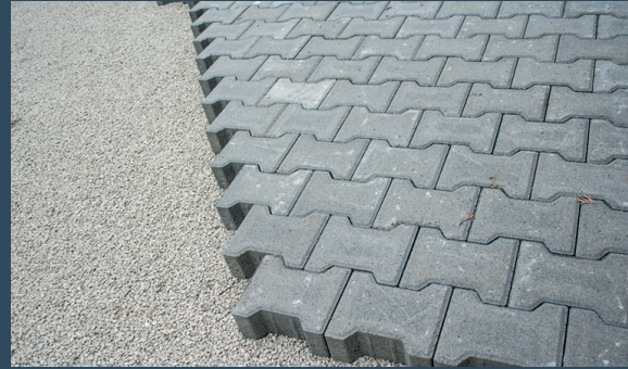
Painting, Flooring, walls, Ceiling, Grouting, Interlock Installing