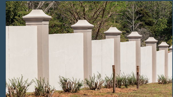
Boundary Walls Construction