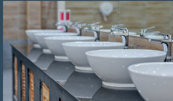
Plumbing and Washroom Refurbishment