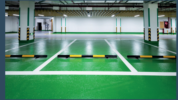
Car Parking works including Curb Stone and Asphalt work