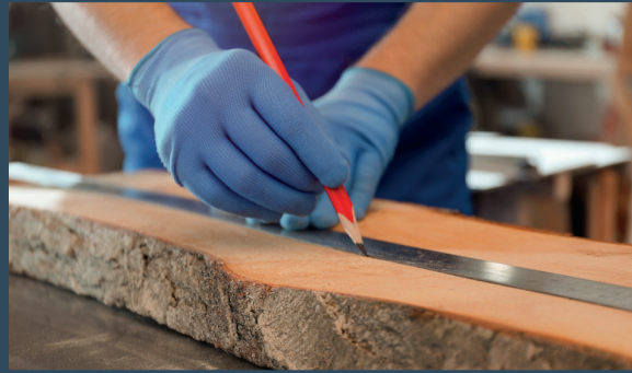
All types of Wooden Works