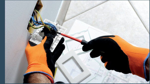
All kind of MEP works