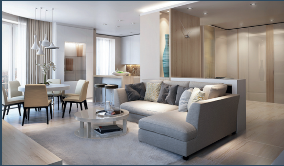
Refurbishment, renovation and interior design with lighting